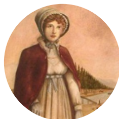
ANNA MARIA DOYLE SCHOLARSHIP