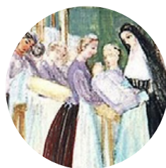
CLARE AUGUSTINE MOORE SCHOLARSHIP