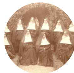
ELIZABETH HARLEY SCHOLARSHIP