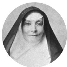
MARY VINCENT WHITTY SCHOLARSHIP