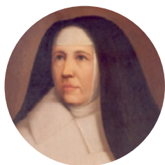
ELIZABETH MOORE SCHOLARSHIP