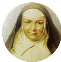
URSULA FRAYNE SCHOLARSHIP