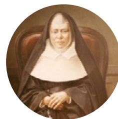
FRANCES WARDE SCHOLARSHIP

The Scholarship Committee will meet to decide the recipients of the Year 11 Scholarships. Each scholarship will be paid in two instalments of $750. The first instalment will be disbursed at the end of Semester 1 and the second at the end of Semester 2 in Year 11.