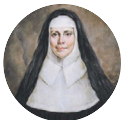
CATHERINE MCAULEY SCHOLARSHIP